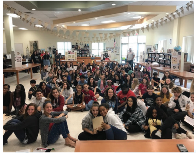
Reality fairs at Demopolis High School (left), and Bak Middle School (right), facilitated by the Southeastern Credit Union Foundation, Naheola Credit Union and Guardians Credit Union