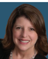
Jan Page Community South Credit Union (FL)