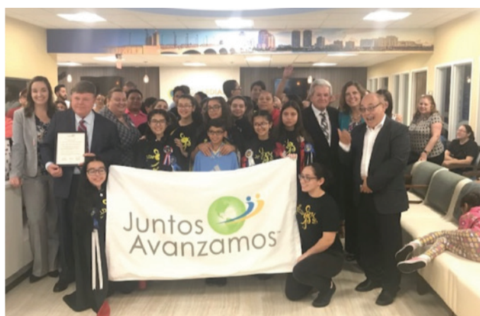
Congratulations to Tampa Bay FCU in Tampa, FL and Guardians CU in West Palm Beach, FL, the latest Juntos Avanzamos designation recipients.

The SECUF facilitated a session at the Community Development Financial Institution (CDFI) convening in San Juan, Puerto Rico. This event served to assist credit unions in understanding and obtaining the CDFI certification and working to create partnerships between credit unions in Puerto Rico and Florida.